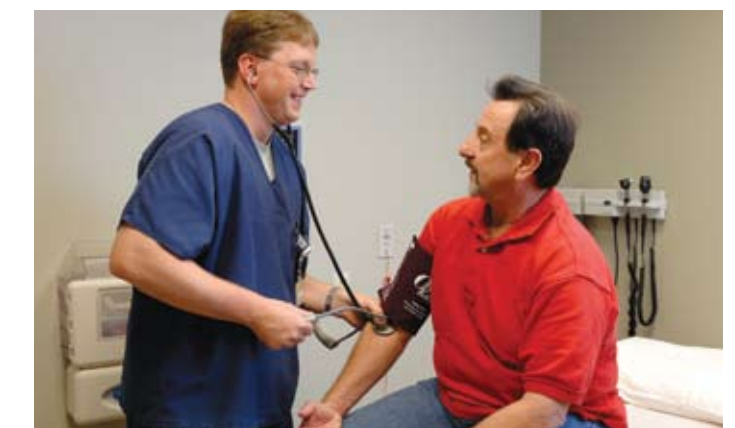
Private exam and procedure rooms