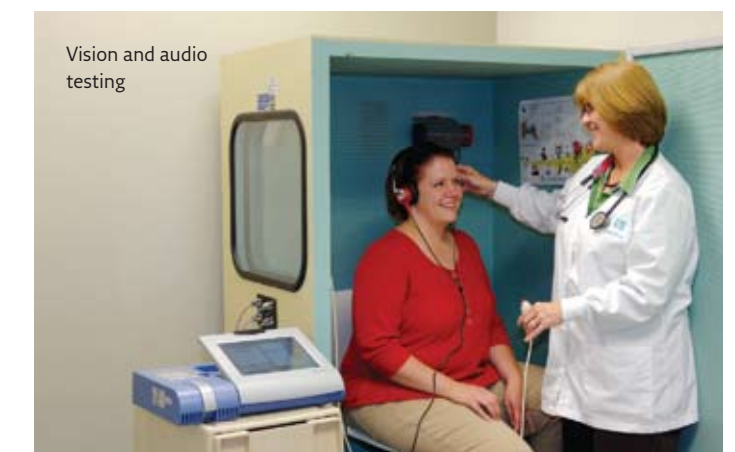
Vision and audio testing