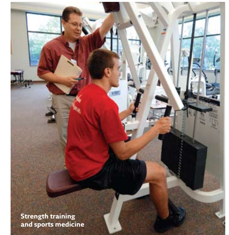
Strength training and sports medicine

The Herbert-Perna Center for Physical Health Walkway is directly across from the mile-long walking path on the Rutherford B. Hayes Presidential Center grounds. You can cross over Memorial Parkway to complete both trails. It's a perfect opportunity to get some exercise and enjoy the beauty and historical significance of the area.